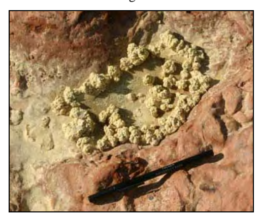
Figure 2. Efflorescent salt collected in an evaporated pool of the river bed.

next samples. This approach is similar to that used on Mars with remote mineralogical tools.