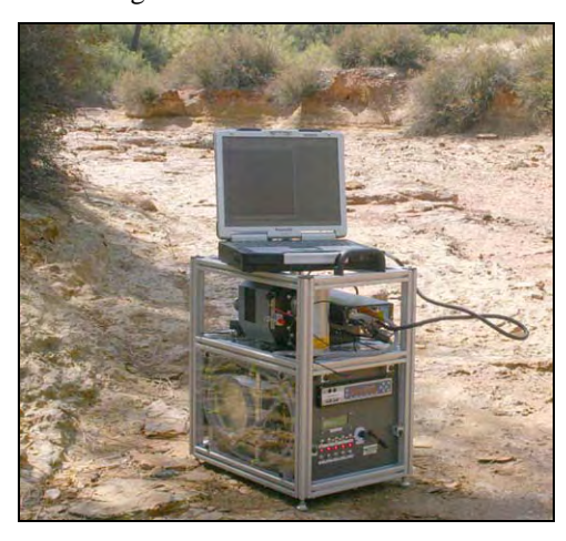
Figure 1. CheMin 4 instrument in Rio Tinto river bed with optional laptop computer for graphic user interface.

tic radiation from the cobalt target as well as Bremsstrahlung radiation.