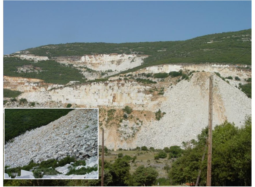
Fig.4 (on the right): Stenopos – general view and detail from stockpiled marble waste