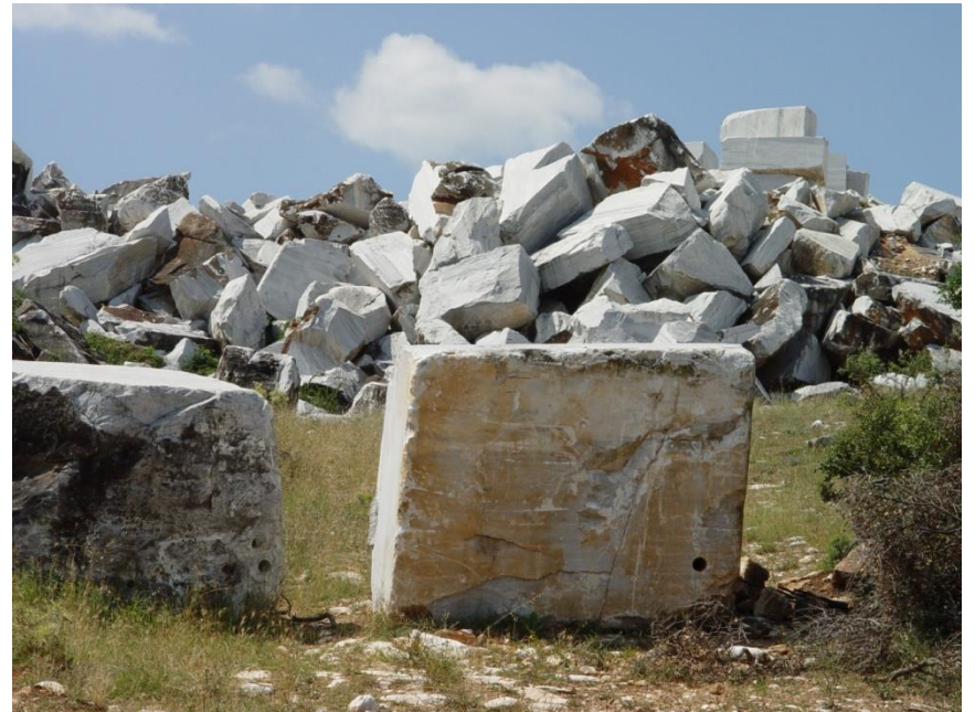
Fig.6 (on the right): Stockpiled marble waste (Disvato)