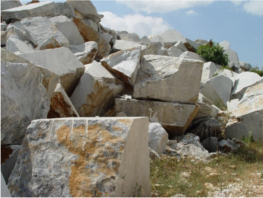
Fig.3 (on the left): Stockpiled marble waste (E. Falakro – Vathilakkos / Monastiraki)