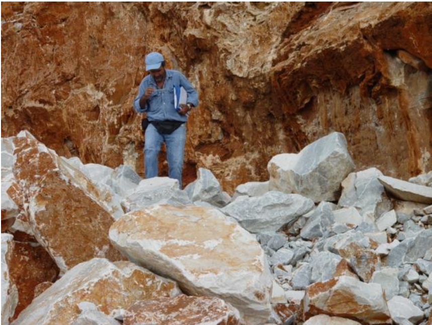
Fig.5 (on the left): Working in the field (Limnia)