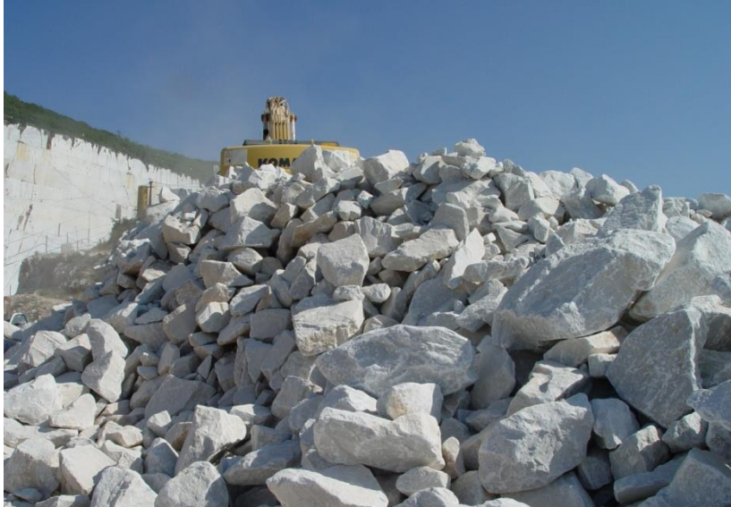
Fig.7: Marble waste prepared to feed a fillers producing mill (Stenopos)

The abovementioned recent market study on fillers, which was accomplished within the framework of a National Strategic Reference Framework (NSRF) project for Non-Energy Mineral Raw Materials (MEOPY) which is run by IGME, confirmed these predictions. In particular, based on the conclusions of the study, the following can be